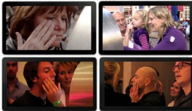
Fig. 1. Actors participating in the ASL caress their faces.

This paper describes and analyses two experiments in outdoor city public spaces to explore the effect of the interface design choices through research through design [17]. Two experiments explore the design choices, based on 1) observations (by a Host, see below) of participants’ actions and reactions; 2) thick descriptions of open ended interviews with participants; 3) photo and short video documentation that support these observations, when available.