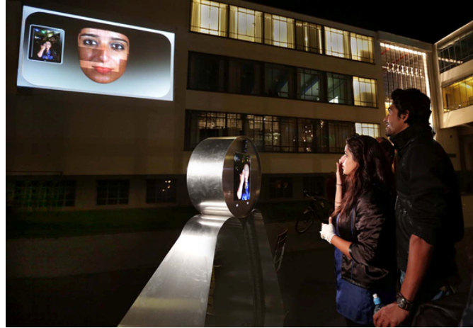
Fig. 5. Participants exploring in the ASL. Connecting Cities.