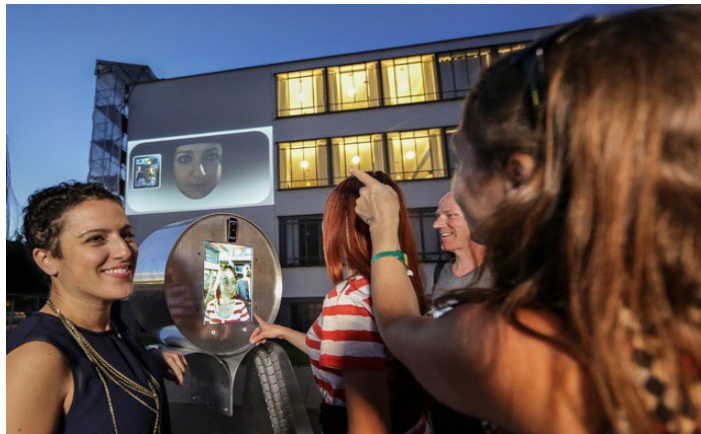
Fig. 4. Participants exploring in the ASL Connecting Cities. © Lancel/Maat 2013.

The ASL synthesis is activated by a Host, Actors and Spectators. Relations between caressing gestures, gesture tracing on screen and a resulting shared Virtual Persona, incite playful immersion for both Actors and Spectators. This immersion is established only when both screen and caressing gestures can be seen or experienced from one spatial position. The Hosting design creates conditions for all kinds of caressing and allows Actors to fully concentrate on this process. People experiment with acts and experiences of caressing, while expressing and sharing pleasure and joy. Even when acts of caressing result in merely ‘losing touch with surrounding Spectators’, Actors still need the witnessing presence of the Spectators’ gazes around them, to experience their gestures as socially engaging. Moreover, the unpredictable results of merging portraits, becomes exciting only when witnessed and discussed by others. Co-creation of the Virtual Personae on screen seems to incite participation.